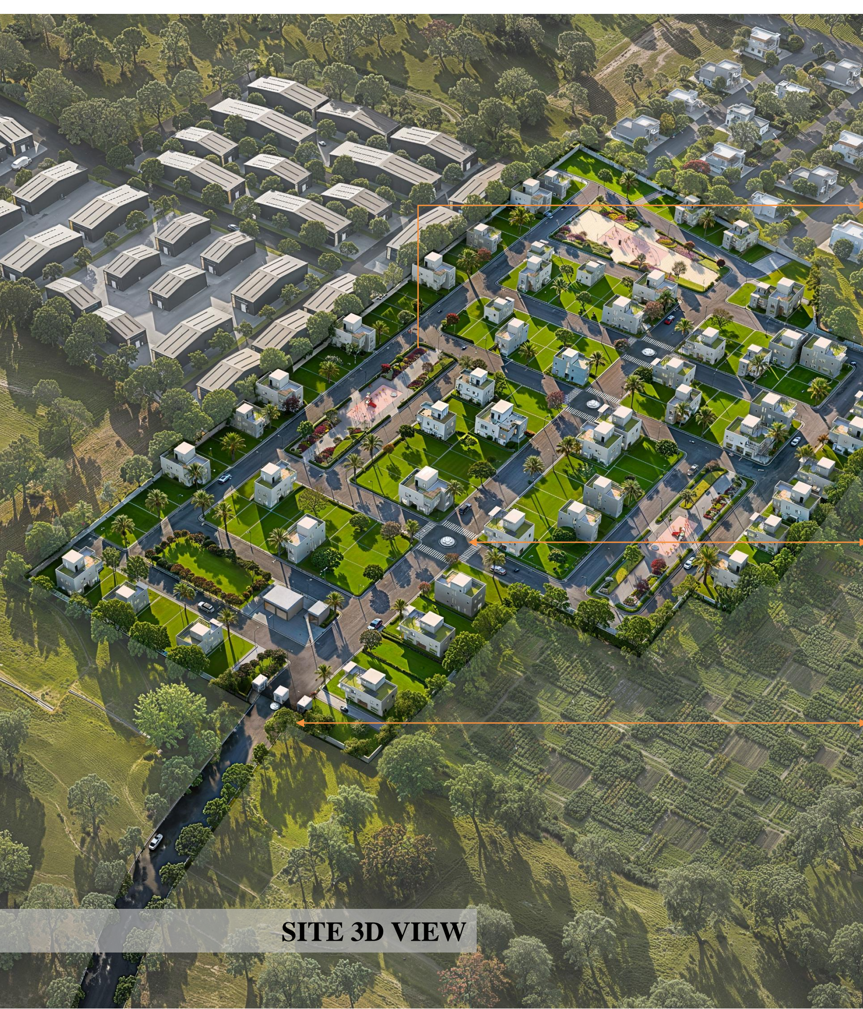
SITE 3D VIEW