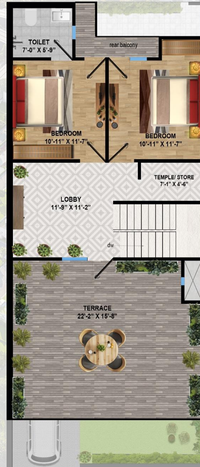
FISRT FLOOR PLAN