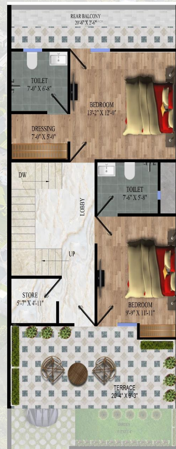
FISRT FLOOR PLAN