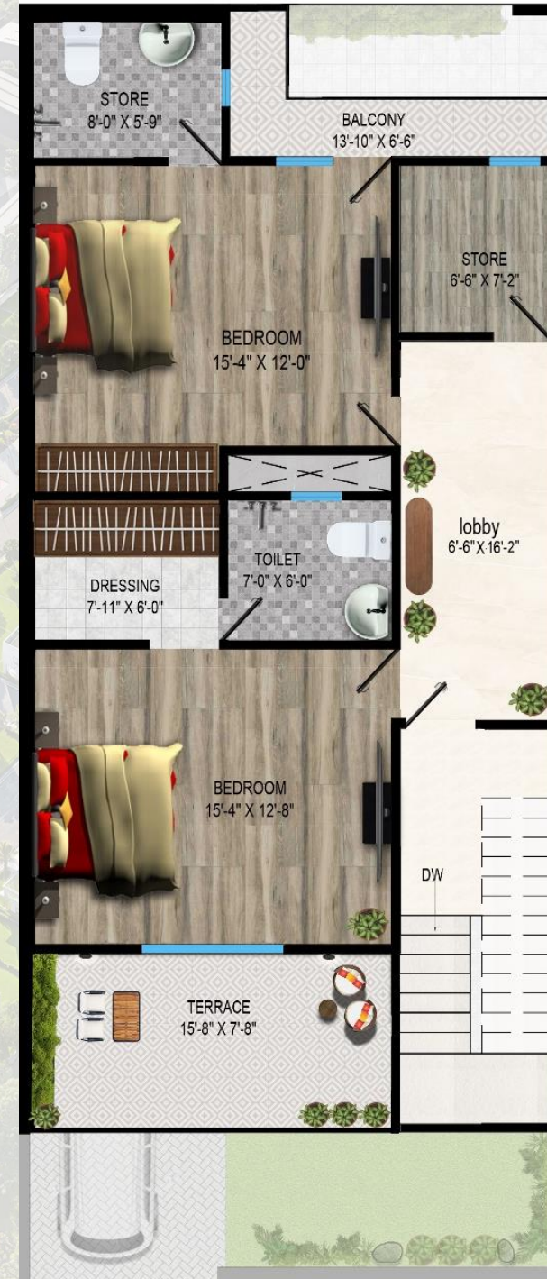
FISRT FLOOR PLAN