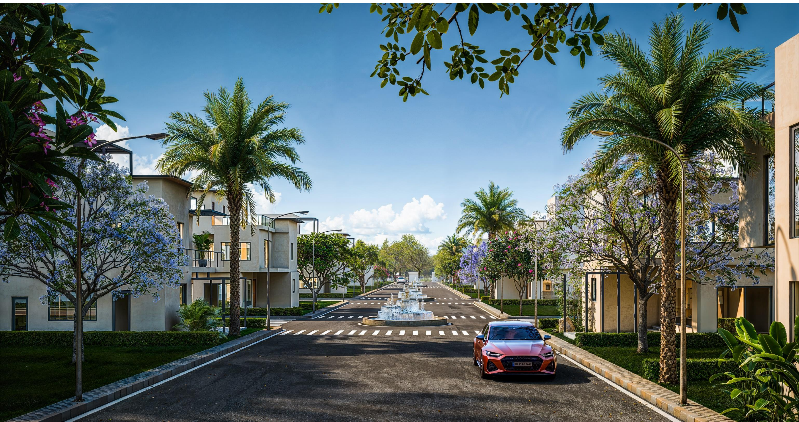
INTERNAL ROAD VIEW