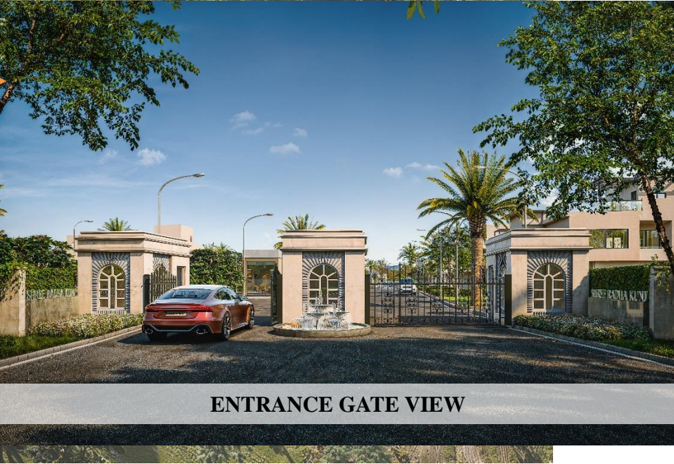
ENTRANCE GATE VIEW