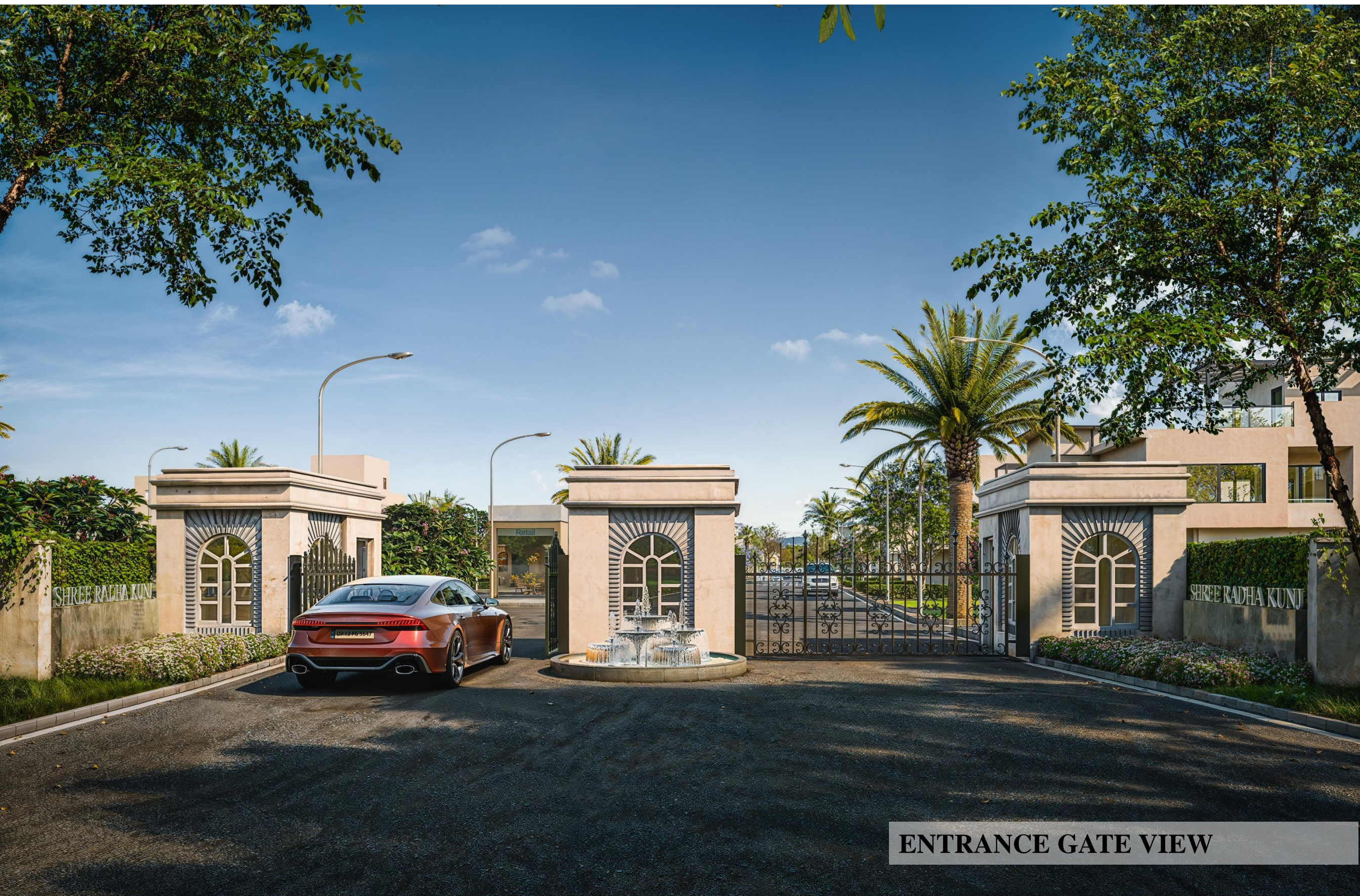
ENTRANCE GATE VIEW